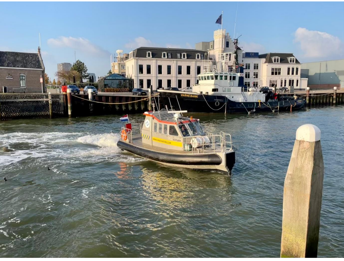
© Sima Shipbrokers B.V. Unauthorized use and/or duplication of this material without express and written permission from Sima Shipbrokers B.V. is strictly prohibited.